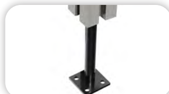
COMPOSITE POST MOUNT 67 x 25 x 2500mm for composite post application