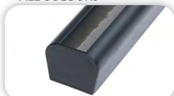
ALUMINIUM INSERTS & CAP 1830 x 40 x 40mm for concrete post application