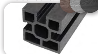
COMPOSITE POST 2400 x 100 x 100mm for composite post application