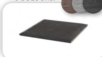
COMPOSITE POST CAP 120 x 120 x 30mm for composite post application